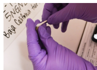
Top: A small oiled frog is cleaned with a cotton swab.; Bottom: A frog is released back into its habitat.