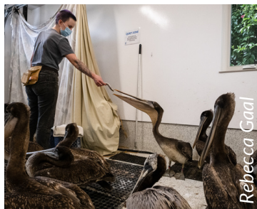
A staff member feeds pelicans inside the new Wildlife Hospital.