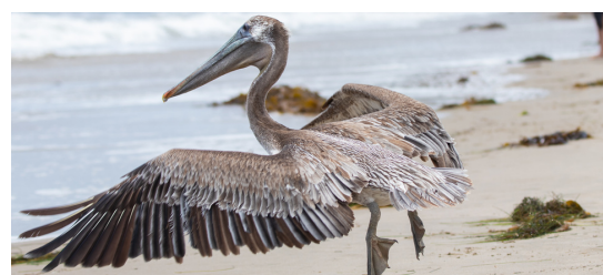
A group of rehabilitated pelicans released at Butterfly Beach in Montecito.

In order to qualify for release, the animal care team looks for a few important benchmarks, including the pelican's body condition, feather quality, and mentation. In total, SBWCN released more than 60 brown pelicans that were ready to rejoin the wild population.